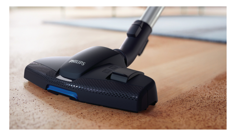
MultiClean nozzle is designed to seal closely to the floor to ensure thorough cleaning across all floor types.